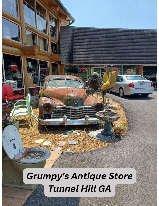
Grumpy's Antique Store Tunnel Hill GA