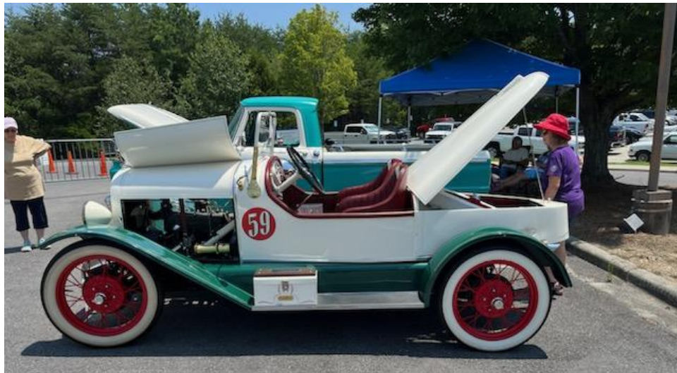
1929 Ford Roadster