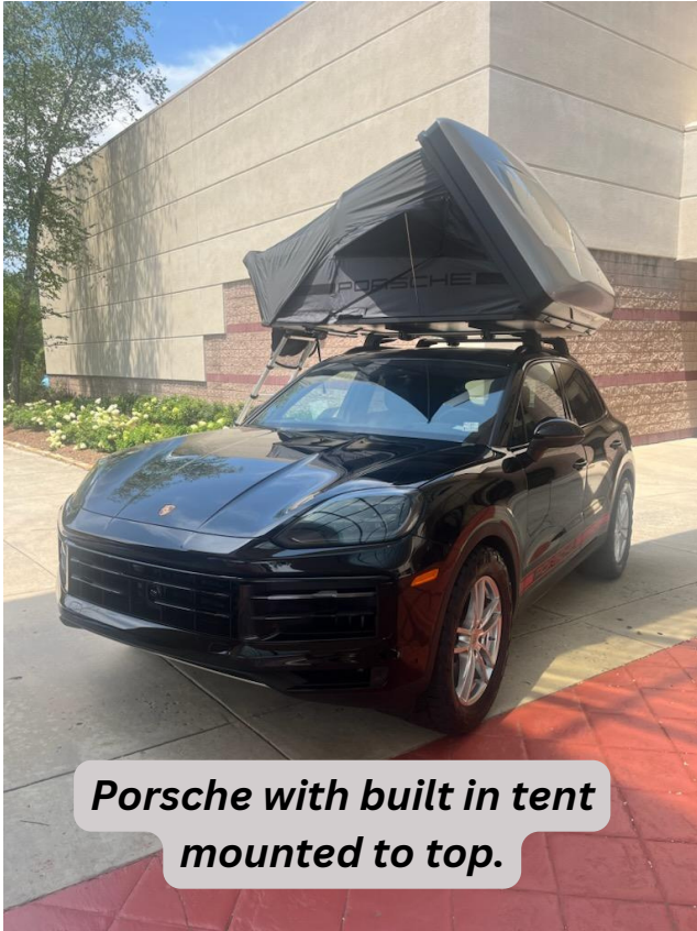
Porsche with built in tent mounted to top.