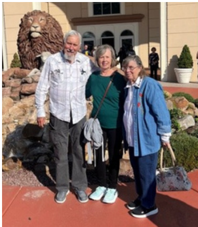
“The Story of Moses” at the Sight and Sound Theater in Lancaster, PA