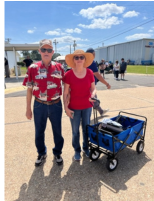
Moultrie Swap Meet 3.21.2023