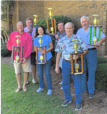
Graceville Car Show 10.16.2021