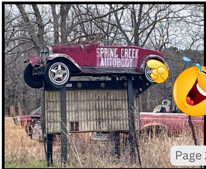
submitted by Bill Stockton