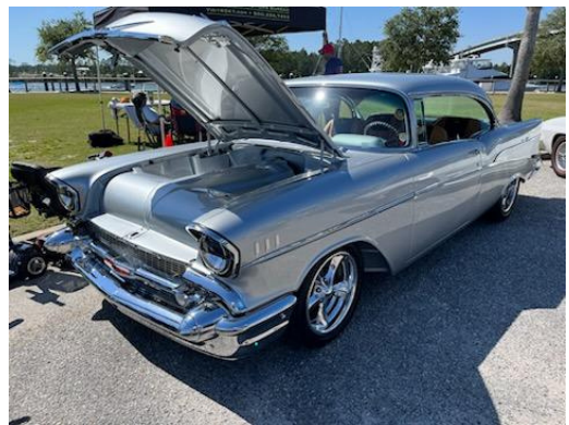
Some of Linda's favorites!